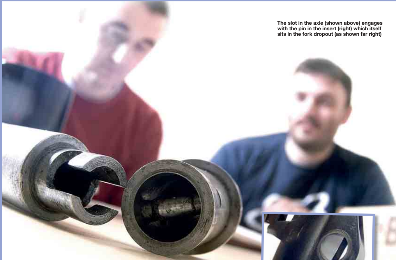
The slot in the axle (shown above) engages with the pin in the insert (right) which itself sits in the fork dropout (as shown far right)